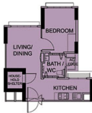
TYPICAL STUDIO APARTMENT (TYPE A) FLOOR PLAN APPROX. FLOOR AREA 37 sqm (Inclusive of Internal Floor Area 35 sqm and Air-Con Ledge)