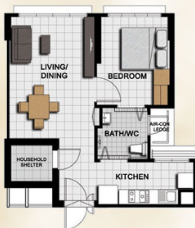
TYPICAL STUDIO APARTMENT (TYPE B) FLOOR PLAN APPROX. FLOOR AREA 47 sqm (Inclusive of Internal Floor Area 45 sqm and Air-Con Ledge)