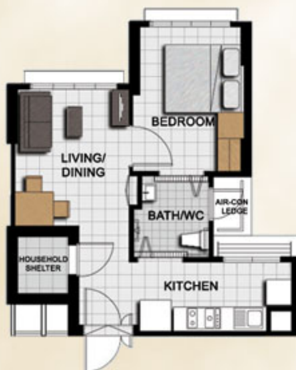
TYPICAL STUDIO APARTMENT (TYPE A) FLOOR PLAN APPROX. FLOOR AREA 37 sqm (Inclusive of Internal Floor Area 35 sqm and Air-Con Ledge)