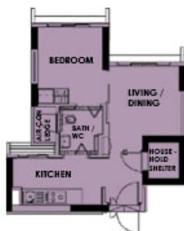
TYPICAL STUDIO APARTMENT (TYPE A) FLOOR PLAN APPROX. FLOOR AREA 37 sqm (Inclusive of Internal Floor Area 35 sqm and Air-Con Ledge)