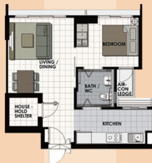
TYPICAL STUDIO APARTMENT (TYPE B) FLOOR PLAN APPROX. FLOOR AREA 47 sqm (Inclusive of Internal Floor Area 45 sqm and Air-Con Ledge)