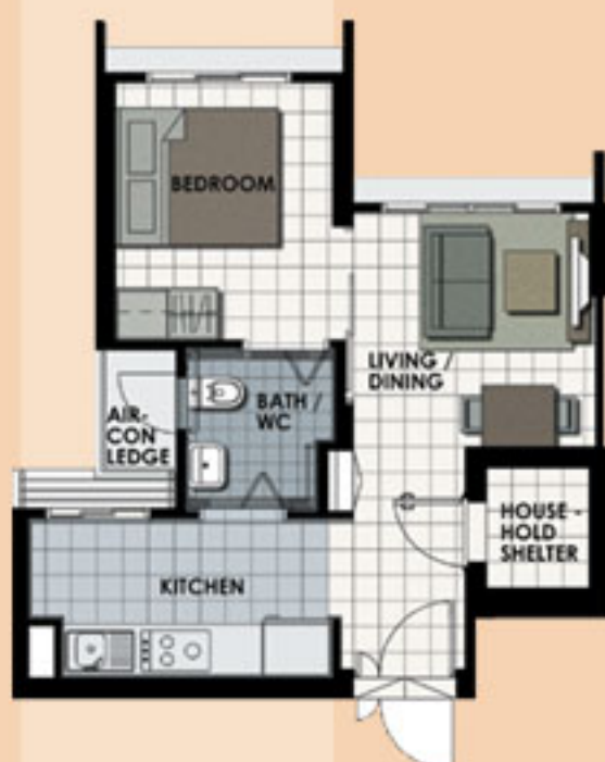
TYPICAL STUDIO APARTMENT (TYPE A) FLOOR PLAN APPROX. FLOOR AREA 37 sqm (Inclusive of Internal Floor Area 35 sqm and Air-Con Ledge)