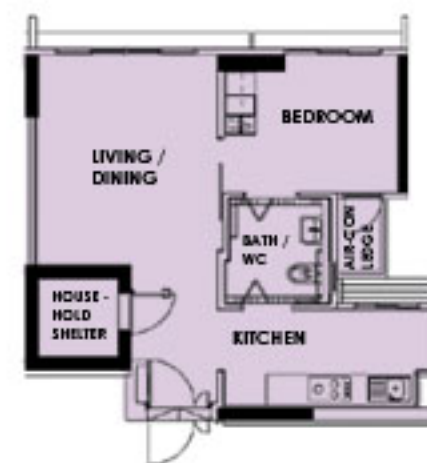
TYPICAL STUDIO APARTMENT (TYPE B) FLOOR PLAN APPROX. FLOOR AREA 47 sqm (Inclusive of Internal Floor Area 45 sqm and Air-Con Ledge)