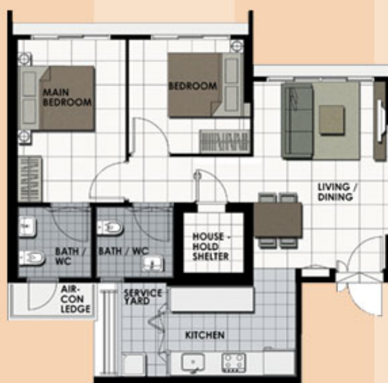
TYPICAL 3-ROOM FLOOR PLAN APPROX. FLOOR AREA 67 sqm (Inclusive of Internal Floor Area 65 sqm and Air-Con Ledge)