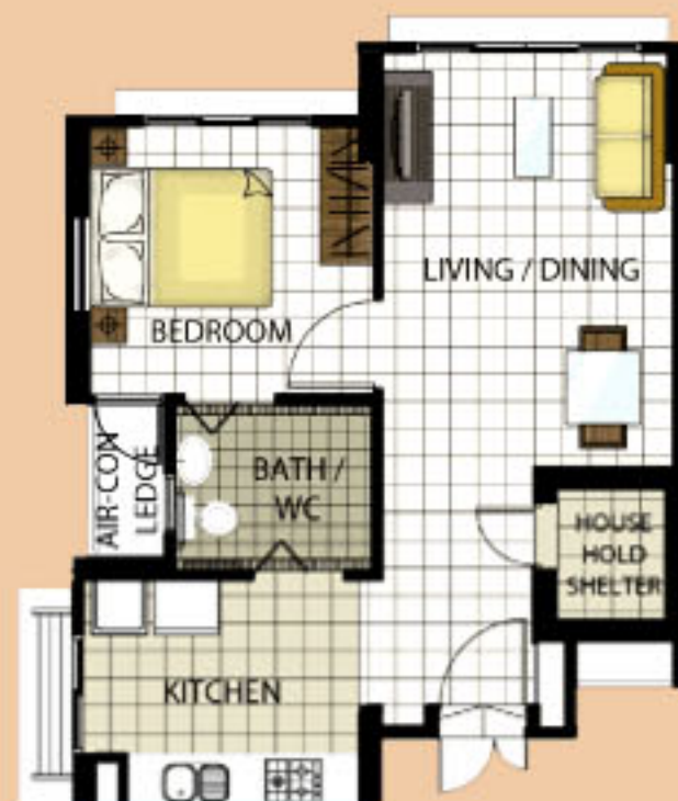
TYPICAL STUDIO APARTMENT (TYPE B) FLOOR PLAN APPROX. FLOOR AREA 47 sqm (Inclusive of Internal Floor Area 45 sqm and Air-Con Ledge)