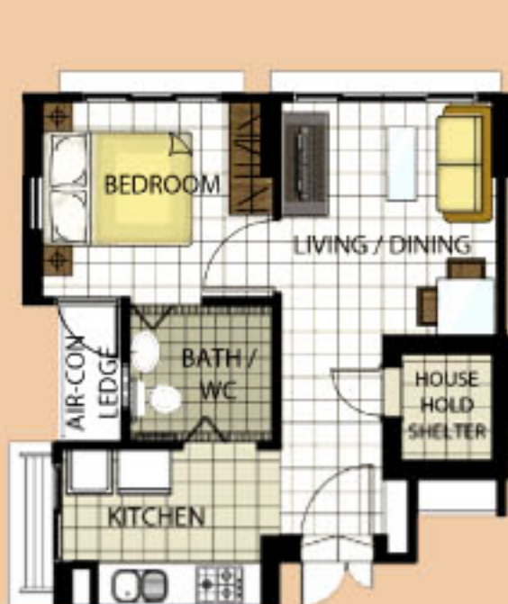
TYPICAL STUDIO APARTMENT (TYPE A) FLOOR PLAN APPROX. FLOOR AREA 37 sqm (Inclusive of Internal Floor Area 35 sqm and Air-Con Ledge)