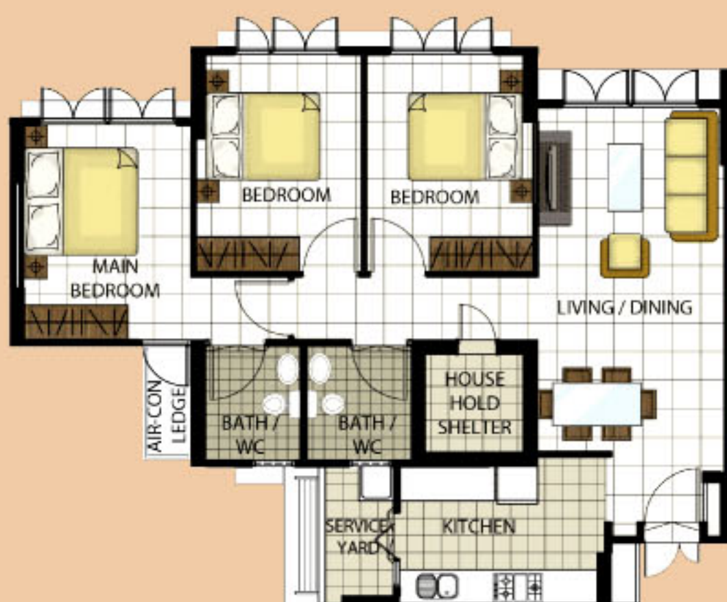
TYPICAL 4-ROOM FLOOR PLAN APPROX. FLOOR AREA 92 sqm (Inclusive of Internal Floor Area 90 sqm and Air-Con Ledge)