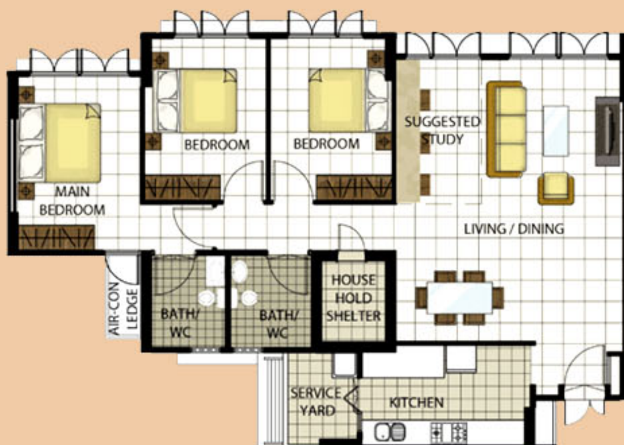
TYPICAL 5-ROOM FLOOR PLAN APPROX. FLOOR AREA 112 sqm (Inclusive of Internal Floor Area 110 sqm and Air-Con Ledge)