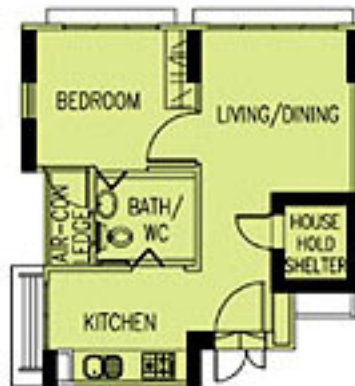
TYPICAL STUDIO APARTMENT (TYPE A) FLOOR PLAN APPROX. FLOOR AREA 37 sqm (Inclusive of Internal Floor Area 35 sqm and Air-Con Ledge)