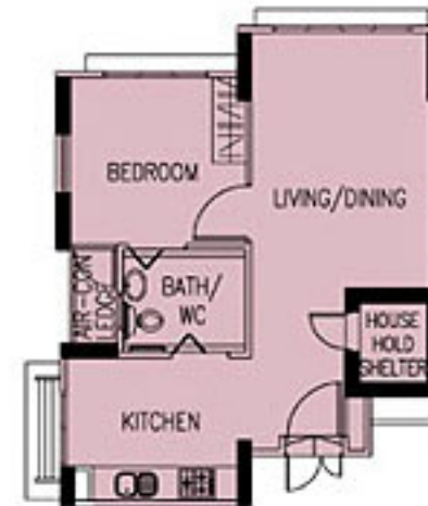
TYPICAL STUDIO APARTMENT (TYPE B) FLOOR PLAN APPROX. FLOOR AREA 47 sqm (Inclusive of Internal Floor Area 45 sqm and Air-Con Ledge)